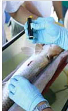
Sonic transmitter implant

The Redfish Tracking team is made up of scientists and professional staff from the University of Florida Sea